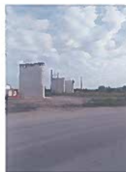
Overpass Km 191+938 Feldioara