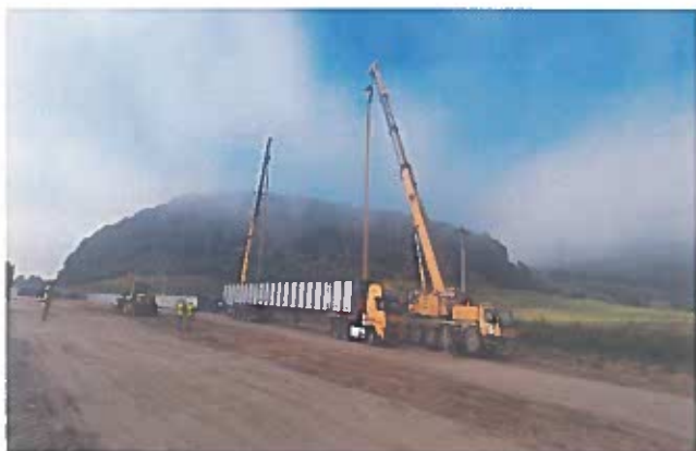
Supply viaduct decks