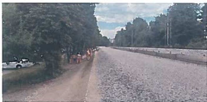
Braşov – Stupini Interval