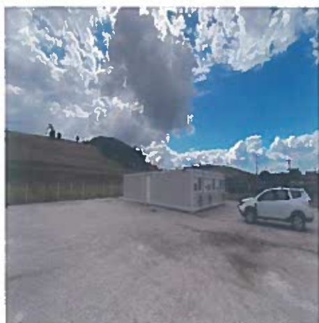
OS Rupea – installation of office containers