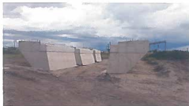
Bridge Km 192+526.157 Feldioara